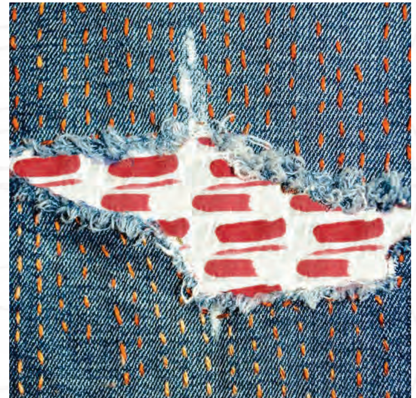
Denim with a hand painted patch