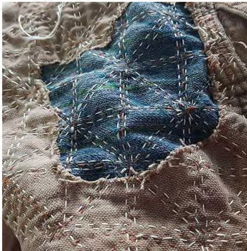
Chino jacket with denim patch