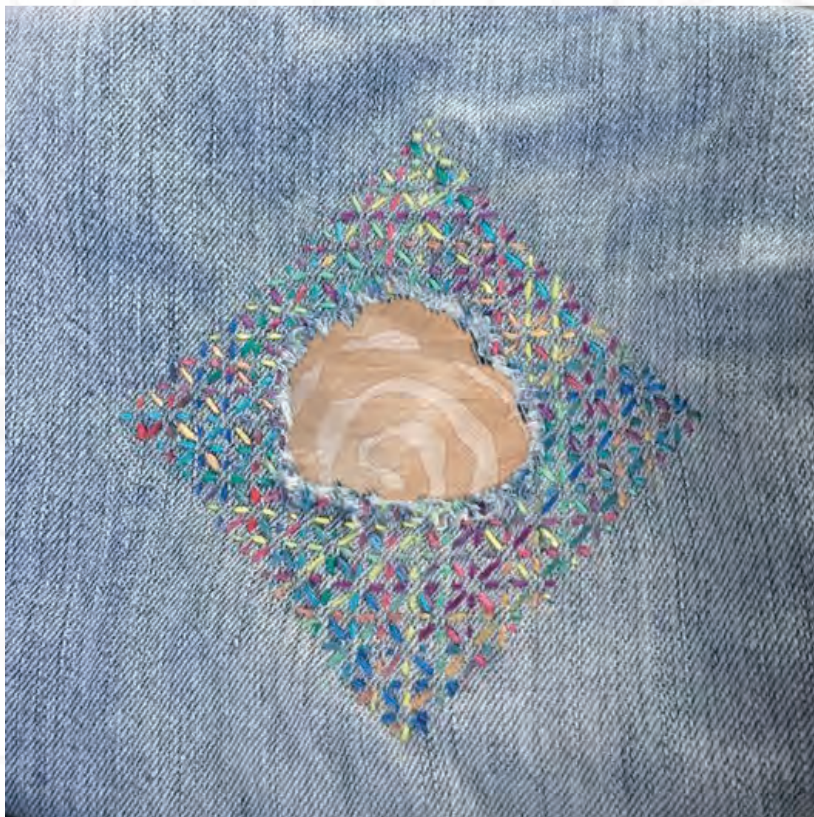
Denim with a tea-dyed patch

At Renaissance Wear , we can add flair and repair your worn out clothes.